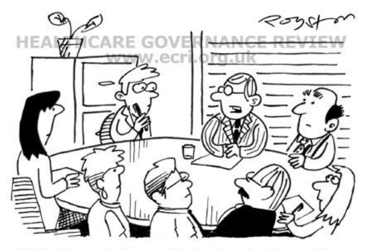
"OK, all those in favour of delegating decision-making, shrug your shoulders."