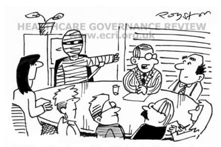
"I think we're all agreed that it is invaluable to have input from local people with real experience of health issues."