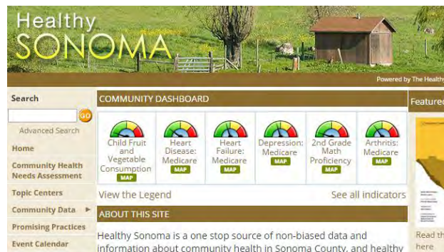
Figure 3. Healthy Sonoma’s Community Dashboard

strategy involves the use of user-friendly dashboards and regular progress reports aimed at a general public audience. Strong examples include the Boston Indicators Project reports 30 and the Jacksonville Community Council reports. 31 Web-based dashboards that focus on providing easy-to-digest overviews of data are becoming an increasingly common and recommended practice. Examples include the soon-to-be-launched California Department of Public Health’s Let’s Get Healthy California dashboard, Green Mountain Care’s Dashboard 2.0, 32 King County’s Communities Count website, 33 and the Healthy Sonoma Community Dashboard (built on the Healthy Communities Institute platform, Figure 3). 34 For an ACH, a dashboard or set of dashboards could serve to highlight evaluation or virtual budget information and engage partners in planning and in reviewing progress.