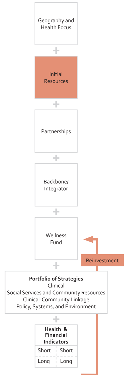
Figure 1: Components of an ACH