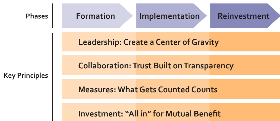
Figure 2. Key principles and phases

Through our research, we identified four key principles for ACH financial sustainability that should be considered in all three phases of implementation (Figure 2). Unsurprisingly, these four principles align closely with the “Six Key Elements of an ACH” identified by the California ACH Work Group (shared vision, leadership, collaboration and partnerships, trusted backbone or integrator organization, data and analytics capacity, wellness fund). The four principles are discussed here from a sustainable investment perspective.